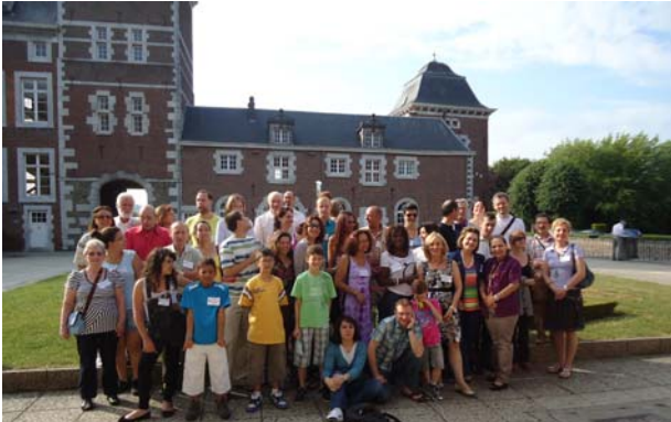
Part of the general public who remained at the Castle till the final event.